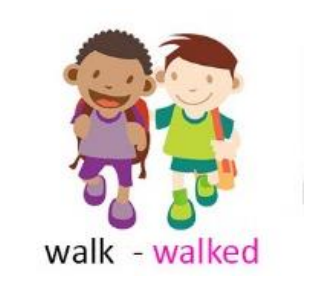
past tense - root word + ed