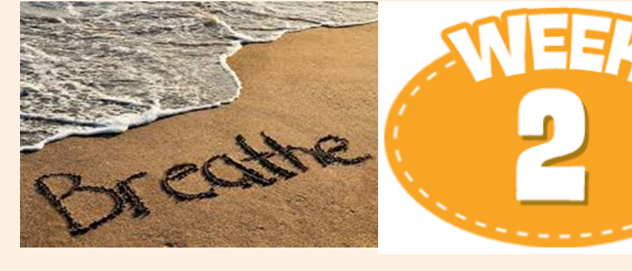
Let's cool down.

Add to your journal how the day went. Also write five things that interest you.